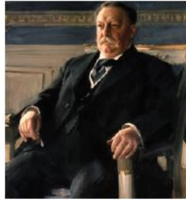
William Howard Taft 1909-1913