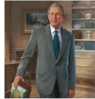
George W. Bush 2001-2009

Scroll through the portraits again and let's take a closer look at the objects in the paintings. We are observing symbolism. What symbols can you find? What might these symbols mean?