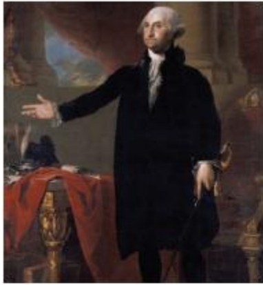
George Washington by Gilbert Stuart 1797