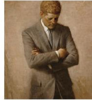
John F. Kennedy 1961-1963